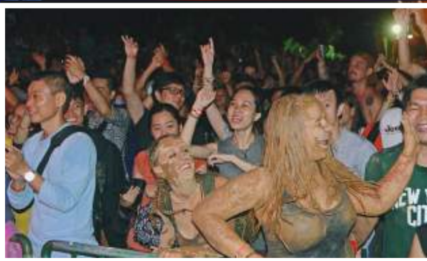
www.asianjourneys.com.sg | October/November 2016 AsianJourneys