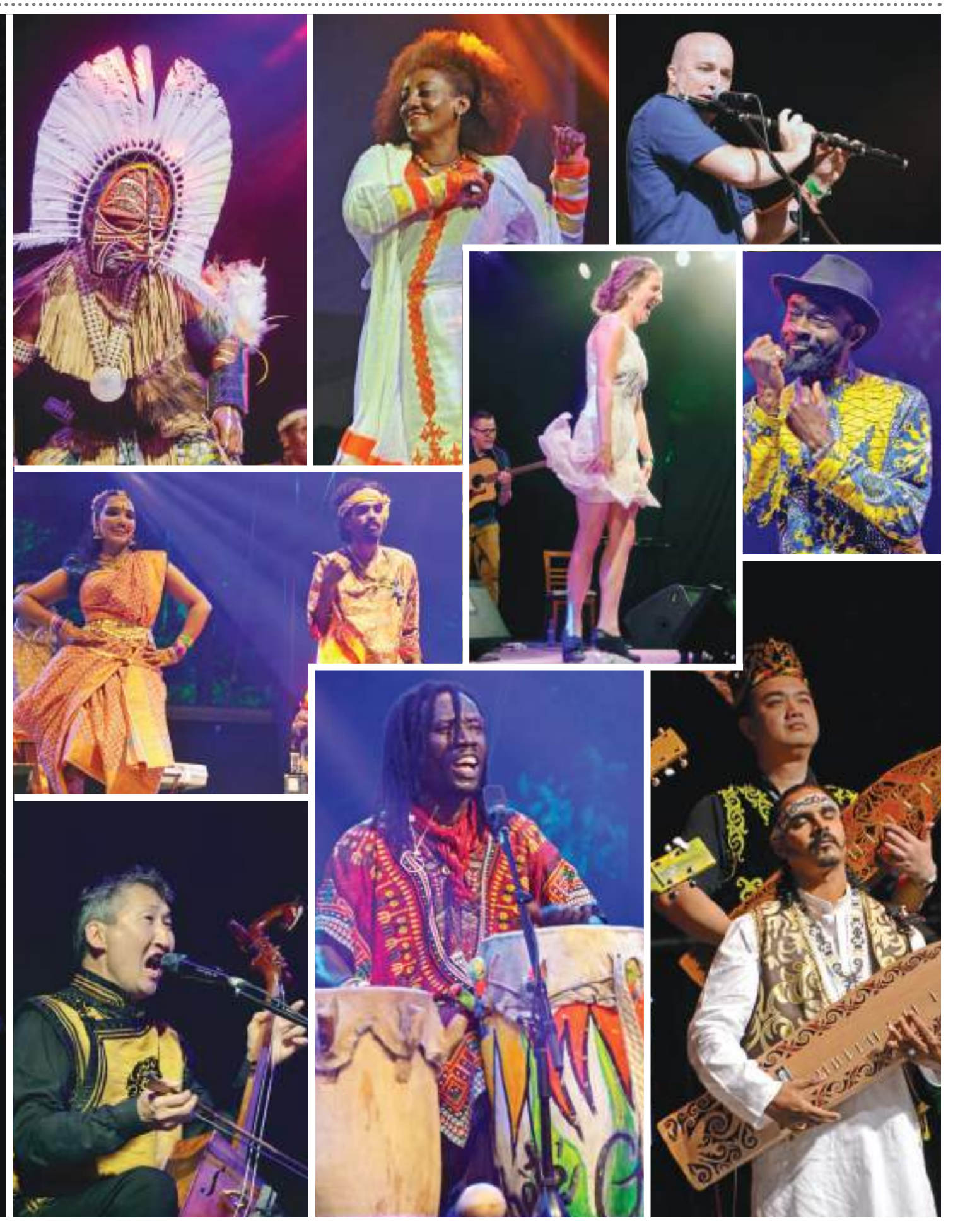
www.asianjourneys.com.sg | October/November 2016 AsianJourneys